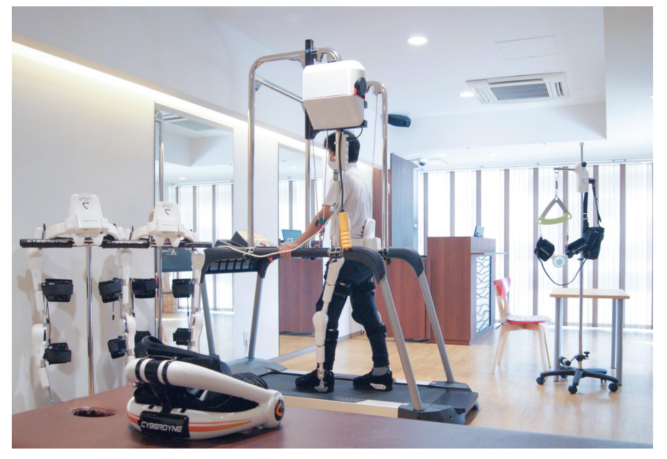
Inside of Fukuoka Robocare Center

Similar to other Robocare Centers, Fukuoka Robocare Center offers the Neuro HALFIT service to visitors with reduced physical function or visitors with a disability, in order to induce improvement in the function of the brain-nerve systems. In this program, Wearable Cyborg HAL is put on wearers who have difficulty standing, sitting or walking on their own, to support movements based on the wearer's own intent of movement.