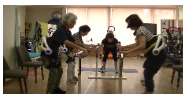
Menu with HAL Lumbar Type