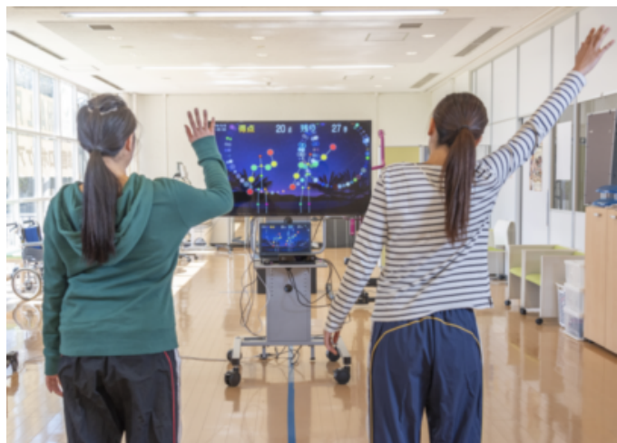
Gaming experience with TANO