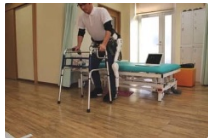
Standing, sitting and balancing