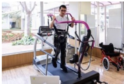
Gait training with treadmills