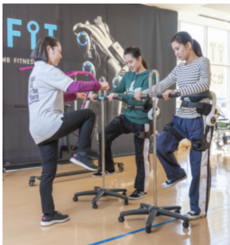
Wearing experience of HAL

CYBERDYNE, INC. [Tsukuba, Ibaraki, the “Company”] currently offers “Neuro HALFIT” to visitors with disability or with weakened physical function due to aging at 14 Robocare Centers around Japan. Neuro HALFIT aims to induce improvement of the function of the brain-nerve-musculoskeletal function of the visitors through use of various cutting-edge technologies such as the world’s first Wearable Cyborg HAL. Out of such centers, the Company’s associated company Nagoya Robocare Center that was operated on pilot bases since its opening on August 2019, will mark its grand opening on January 2020. In order to further extend its recognition, Nagoya Robocare Center will host an opening event where visitors could experience various cutting-edge health technologies such as HAL, on January 25 (Sat) from 10AM to 6PM.