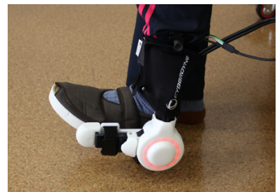
Ex-flex of ankle joints