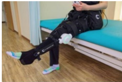
Ex-flex of knee joints