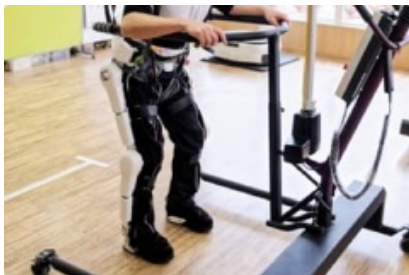
Ex-Flex of knee joints