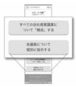
*The pages is only available in Japanese

*If you re-scan the QR code on the enclosed paper, it will display the PC site